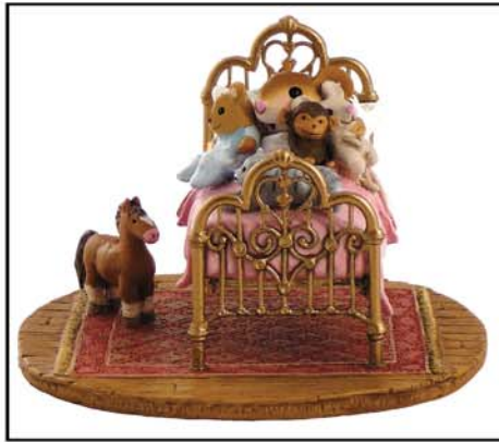
M-412a Her Creature Comforts

Wee Forest Folk introduces this sculpture of a boy or girl mouse snuggled in bed and surrounded by their favorite stuffed animals!