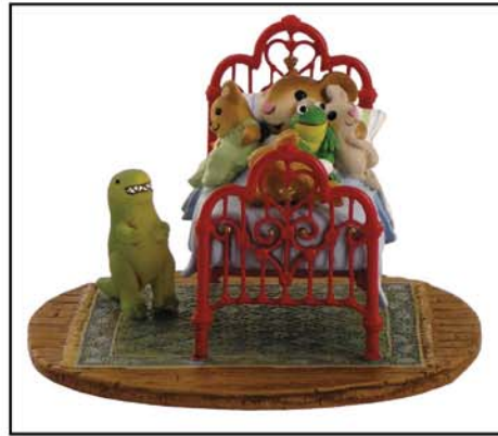
M-412b His Creature Comforts

This piece is available as pictured or can be made more personal and fun! The collector can customize their own by choosing the stuffed animals (pictured below) in and around the bed. The stuffed bear, chick and mouse are the same on each piece and cannot be changed. To customize please see the Creature Comforts order form which is attached.